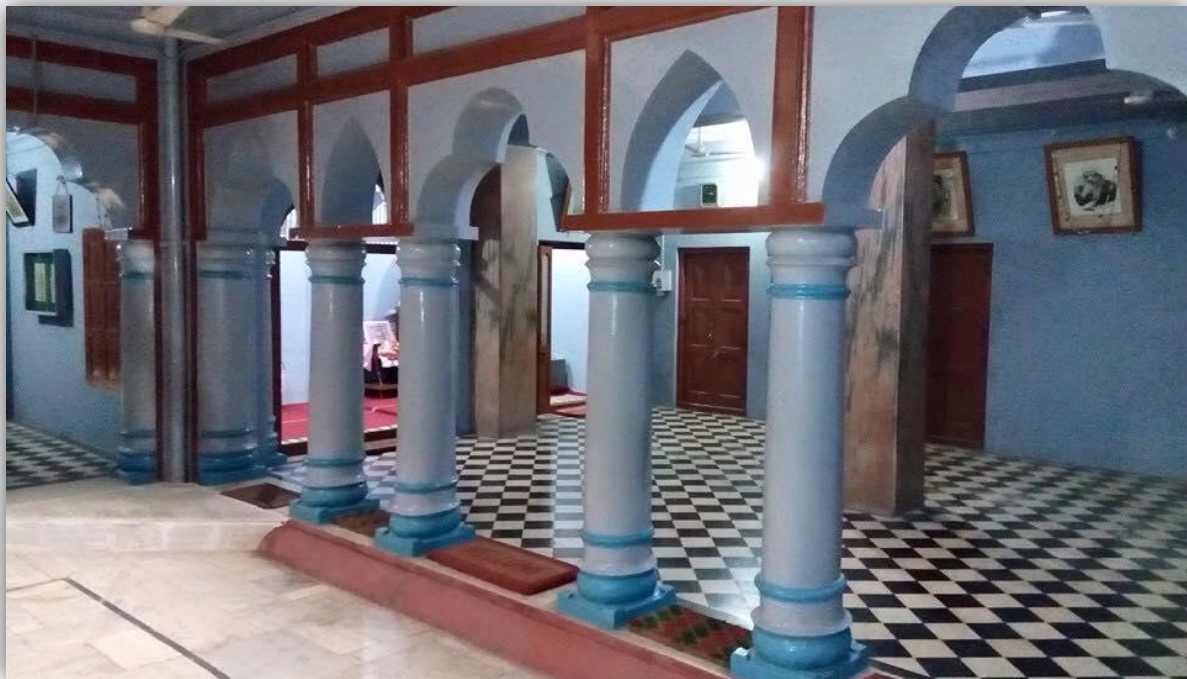
Soami Ji Maharaj's home at Panni Gali in Agra, India

69. These holy discourses are of those Sants and true and perfect lovers of the Supreme Father who reached Sat Lok and became one with the Supreme Being, and see from there the panorama of innumerable Trilokis and Brahmands , each with a separate Brahm , Ishwar , Maya and Shakti , i.e., god of worldly people, numerous incarnations, Brahma's, Vishnus, Mahadeos, gods, prophets, Auliyas , Ambias , Kutubs , Farishtas , Yogeshwars , Gyanis , Rishishwars , Munishwars , Siddhas , Yogis , Indras and Gandharvas . How can such a Sant care for and obey any of these mentioned above? Each Triloki has its own presiding deity called Brahm and Ishwar , that is, Maya-sabal , located respectively at Trikuti and Sahas-dal-kanwal . Innumerable subBrahms and Ishwars have been created by Sat Purush Radhasoami . Only Sants have reached there and none else can. But in their mercy They also liberate all those from the thralldom of Maya and take them to the Feet of Sat Purush Radhasoami who believe in Their words, have love for and faith in Them and attend Their Satsang.