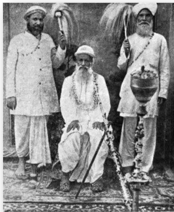
Huzur Maharaj smoking huqqa